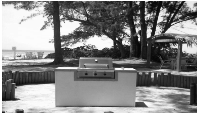
New stainless steel grill in front of unit 2. All grills have been replaced.

We are planning several projects for this year. Most of the work will be completed during maintenance this fall. The list of the fall maintenance projects are as follows: painting the interior of all units, painting the exterior on several units, replacing the carpeting in all units, re-wiring the air handlers and upgrading the heat strips to have better heating capabilities, replacing shutters in some units, replace the roof on two units. Throughout the year we are also planning to finish the landscaping on the bay side, complete the refinishing of the dining room chairs and other furniture that needs attention. We also will be installing new door handles and locks on all units. We recently replaced the grills with stainless steel grills that should last for a long time. They are just beautiful. We purchased new towels, sheets,